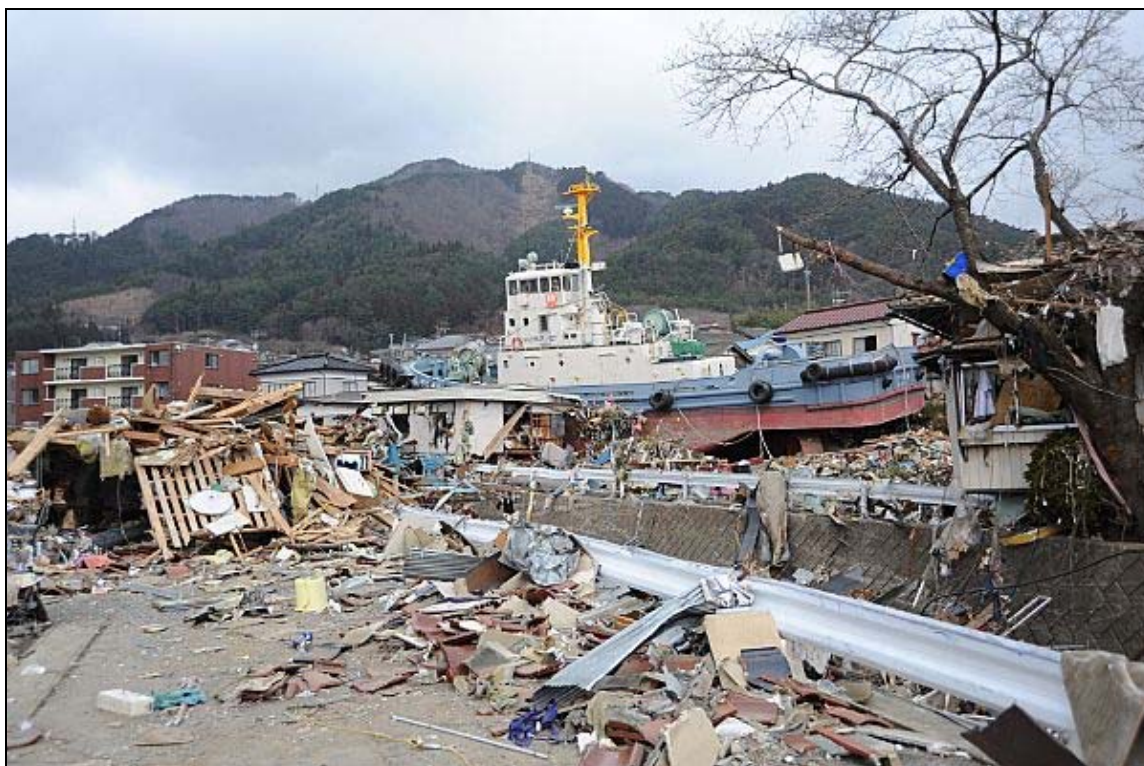
Figure 2.A Tug Boat among Debris in Ofunato, Japan