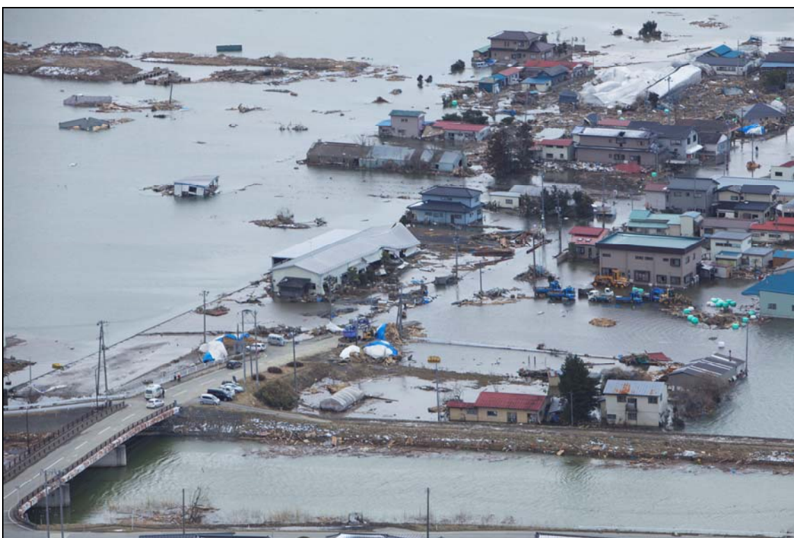
Figure 6. Aerial View of Minato, Japan, a Week After the Tsunami