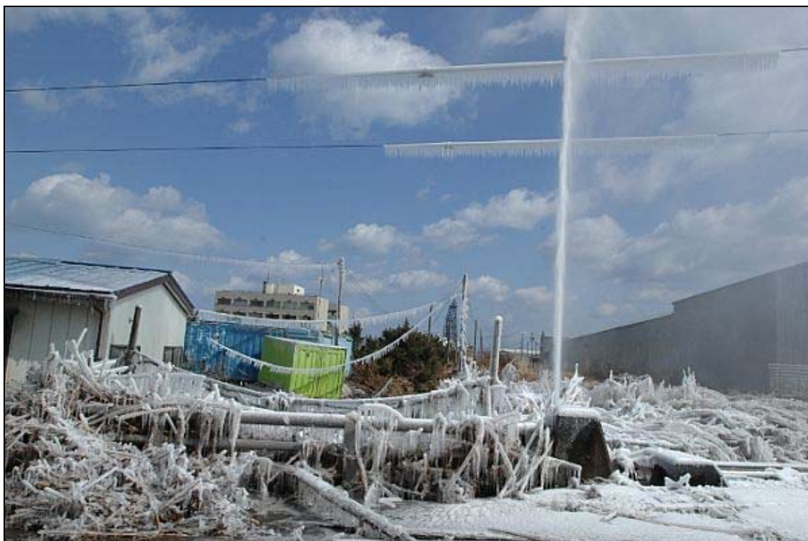
Figure 5.A Damaged Water Pipe Shoots into the Air, Hachinohe, Japan