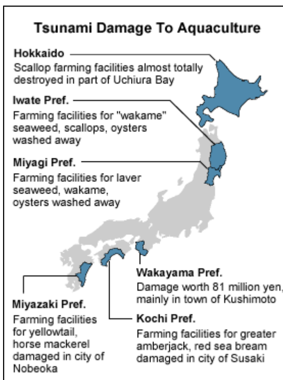
Figure 3. Tsunami Damage to Seafood Cultivation in Japan

The direct damage from Japan's earthquake and tsunami has been concentrated in the northern region of the country, some distance from Japan's industrial heartland. The financial and economic effects, however, are spreading through the Japanese economy, the East Asian region, and also may affect businesses and consumers in the United States. The effect of the record 9.0 earthquake was compounded by the ensuing tsunami that swept as far as six miles inland in Japan, causing widespread destruction, and that spread out across the Pacific. It caused tens of millions of dollars of damage in Hawaii, as much as $40 million in damage in California, and millions of dollars of damage primarily to harbors and boats in Oregon. As shown in Figure 3 , the tsunami also destroyed or damaged aquaculture facilities in prefectures quite distant from the epicenter. The damage, furthermore, has been compounded by the potential nuclear contamination from the Fukushima Daiichi Nuclear Plant plus a shortage of gasoline and of electricity that has caused rolling blackouts in Japan's industrial centers.